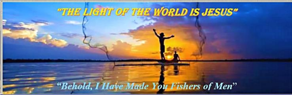
GOD'S LIVING WORD FOR ALL PEOPLE